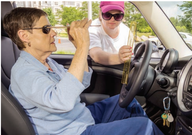
A clear line-of-sight over the steering wheel

CarFit uses a trained team, including occupational therapy practitioners, to assist older drivers with items such as: