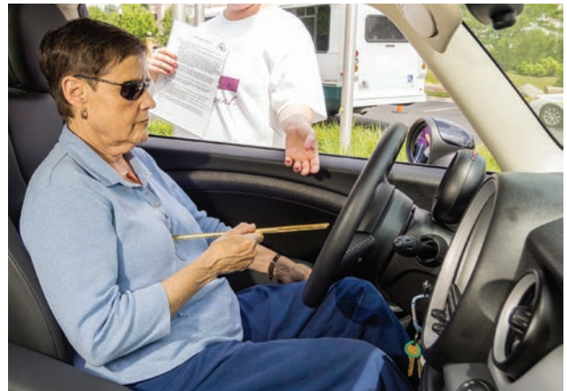
Adequate space between the front air bag/steering wheel and the driver's breastbone; properly adjusted head restraints