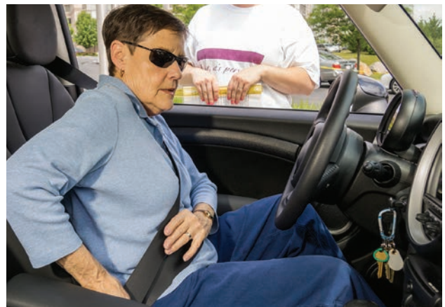
Proper seat belt use and fit, and safe positioning of mirrors to minimize blind spots

According to CarFit participant data, the top four “fit” challenges for older drivers included improper distance from steering wheel (59 percent); adequate and safe views from side mirrors (32 percent); improper seat height (28 percent) and improper head restraint height (21 percent). The good news is that after a run through the CarFit twelve-point program, 97 percent of participants' issues were resolved.